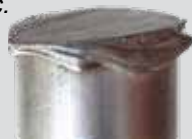
Image of the face of a 1/2" aluminum rod after 30 second of grinding using 40G alugrind Flap Disc.

Melting clearly visible. Work piece reached temperature of over 400 deg C.